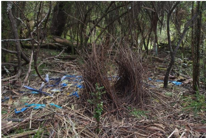
Satin Bowerbird display bower in Pheasant Creek FR

50 species of birds were recorded; the most notable being seasonal summer visitors, such as Brush Cuckoo, Sacred Kingfisher, White-throated Gerygone, Olive-backed Oriole, Cicadabird and Australian Reed-Warbler. Along the track at the eastern end of Pheasant Creek FR a bower and display area with lots of blue objects consisting of Crimson Rosella tail feathers and blue plastic was found after looking for a male Satin Bowerbird seen flying across the track. Other birds of interest were White-necked Heron, Australian Owlet-nightjar, Varied Sitella and a Bassian Thrush caught on one of our motion sensing cameras.