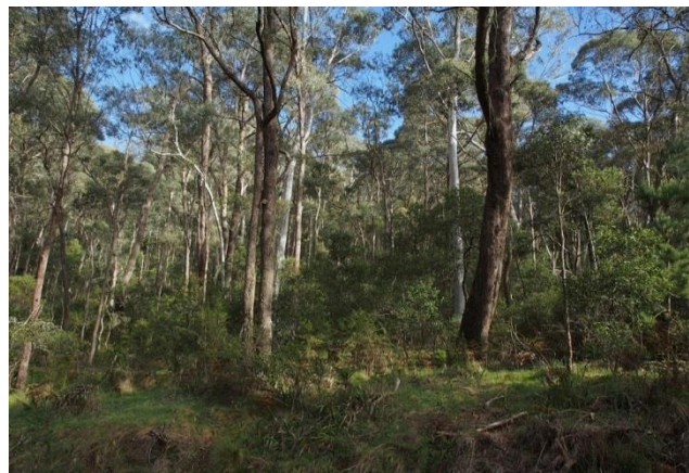
Forest habitat at eastern end of Pheasant Creek FR