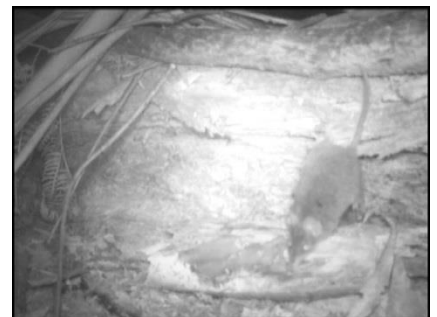
An Agile Antechinus taken from a video clip by a camera set in Pheasant Creek FR

Spotlighting for one hour and 20 mins with two lights on the evening of 3 November, a total of 2.6 spot hours revealed 1 Common Brushtail Possum, five Common Ringtail Possums and three Greater Gliders. The total of number of animals seen was 9, a spotting rate of 3.75 animals per hour.