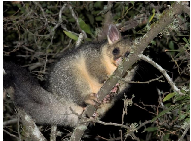
The single Brushtail Possum seen while spotlighting