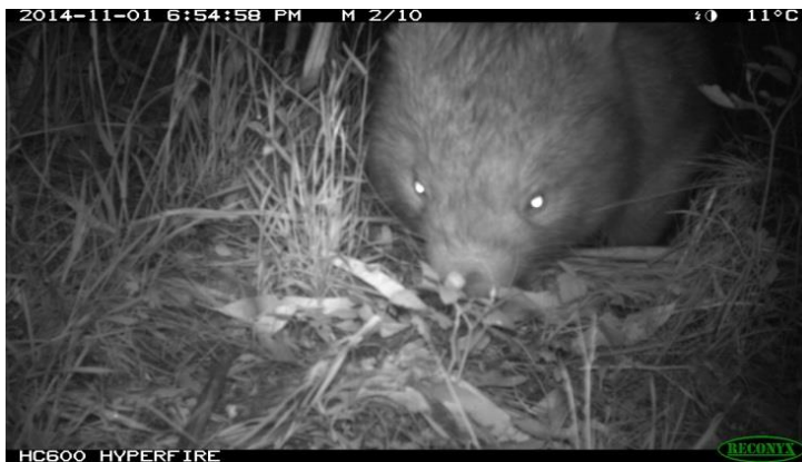
Common Wombat captured by a Reconyx HC600 camera

Wombat, two Black Wallabies, three Bush Rats and one Black Rat at Mountain Creek EA, and a single Agile Antechinus in Pheasant Creek FR. Birds photographed by these cameras during the day include two White-browed Scrubwrens, one Bassian Thrush and two Common Blackbirds.