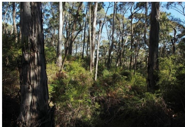
Forest habitat at Mountain Creek Education Area

Over the area surveyed along the nature trail in the headwaters of Mountain Creek at an altitude just above and below 700 metres the dominant trees are tall Victorian Blue Gums – Eucalyptus bicostata , Broadleaf Peppermint – Eucalyptus dives and Narrow-leaf Peppermint – Eucalyptus radiata with a middle storey mostly consisting of Blackwood – Acacia melanoxylon and Silver Wattle – Acacia Dealbata . In the second area surveyed along the Walker Track at a lower altitude of 600 metres the forest was dryer consisting mostly of Narrow-leaf Peppermint – Eucalyptus radiata and some Brittle Gum – Eucalyptus mannifera and Candlebark – Eucalyptus rubida with an understorey of shrubs, bracken, grasses and sedges.