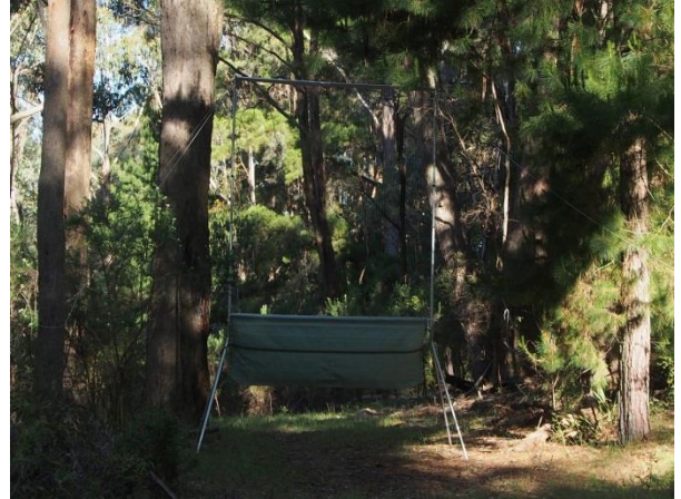
Harp trap set in Mountain Creek Education Area