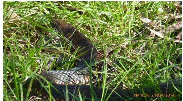
Blotched Blue-tongue and Highlands Copperhead at Mountain Creek