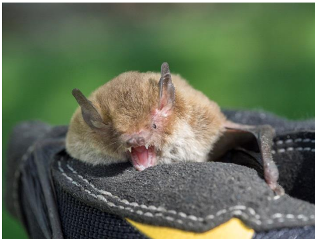
One of six Little Forest Bats captured on 3 November

Two bat 'Harp' traps were set in Mountain Creek Education Area over two nights, one on the nature trail near a creek crossing and another along a track between the reserve and neighbouring pine plantation. Six bats were captured on the second night (3 Nov) which was warm and mild with the temperature not falling below 10 Degrees Centigrade. All six bats were Little Forest Bats, Vespadelus vulturnus .