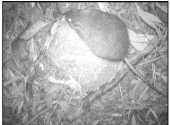
A Bush Rat captured by a video camera

Both images were taken at Mountain Creek Education Area